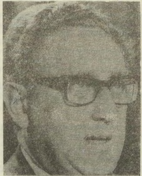
Henry Kissinger, oministeli yoi-kwapondje yaAmerika.

Omushamane Kissinger ova kundafana nale nomushamane Vorster omolwomalinyengo aa, nova kundafana yo nomushamane Sam Nujoma, omupresidende wa SWAPO. Fiyo opaife okumatuka kwaKissinger pokati ka S.A. na SWAPO, inaku holola natango oiimati yasha, mbela okomesho nga.