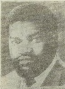
Omupresidende wa SWAPO Sam Nujoma. Ehangano laye ola tokola okulongifa oshikulumbwati opo li te mo S.Afrika ou a anya okuyandja emanguluko kovaNamibia.

2) Toyota Stout Baki. Omodela 1794, ondando otayi ka uthwa moonkundathana. Endelega u imonene po shoye, pula ekwatho kOngalasho yOngeleka, oshako 2018, Ondangwa.