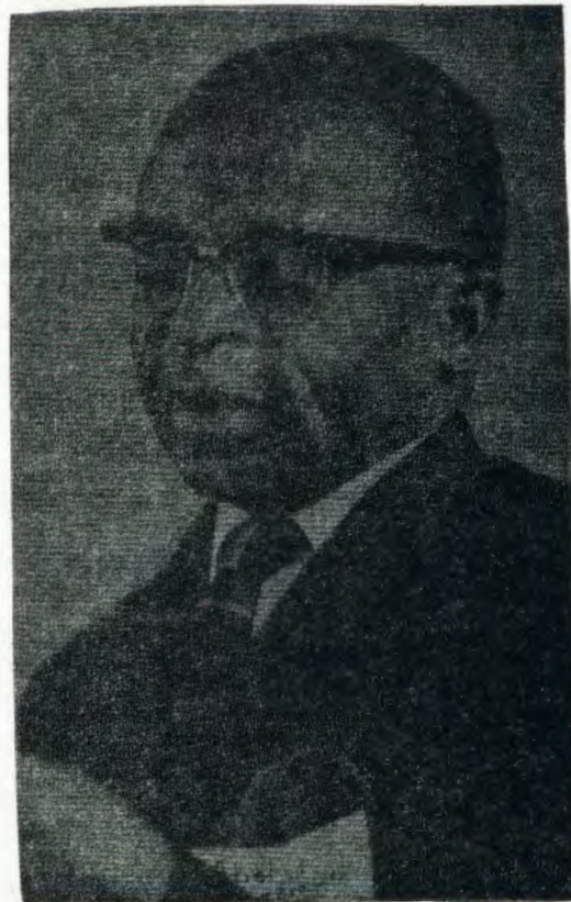
Omubishopi Abel Muzorewa, omupresidende wa A.N.C.

Omuwa oye omunankondo adhihe, ngoka ahalala nota vulu oku tu kwatha, ngele twa hala okukala mewiliko lye esiku kehe.