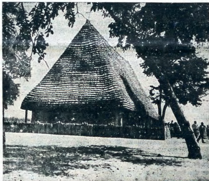
"Omwene, aame ondi hole onhele yongulu yoye nonhele apa tapa kala efimaneko loye."