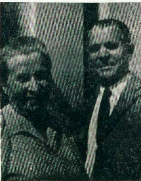
Omuwilikingerki gwongerki yAandowishi; Otto Milk nomukadhi

Kalunga na talalele oomwenyo dhetu. Amen.