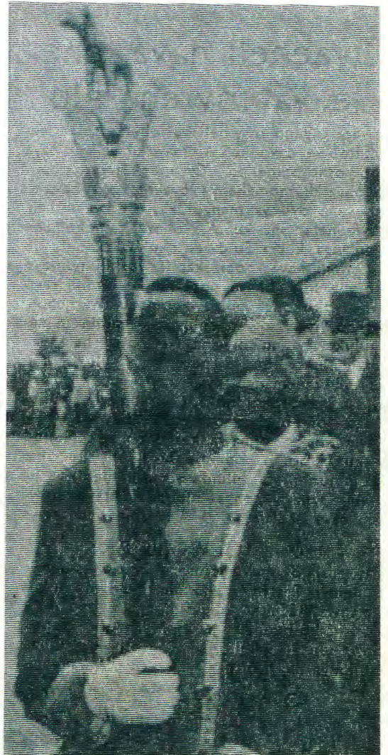
Odimbo yepangelo laTswana ya yandjwa 12. 12. 1968

Osho ekondjo lyaS.A. kutya, kehe omuhoko gwontumba omuludhe gu ningilwe okalongo kagwo nepangelo lyako, muS.A. nenge muSuidwes.