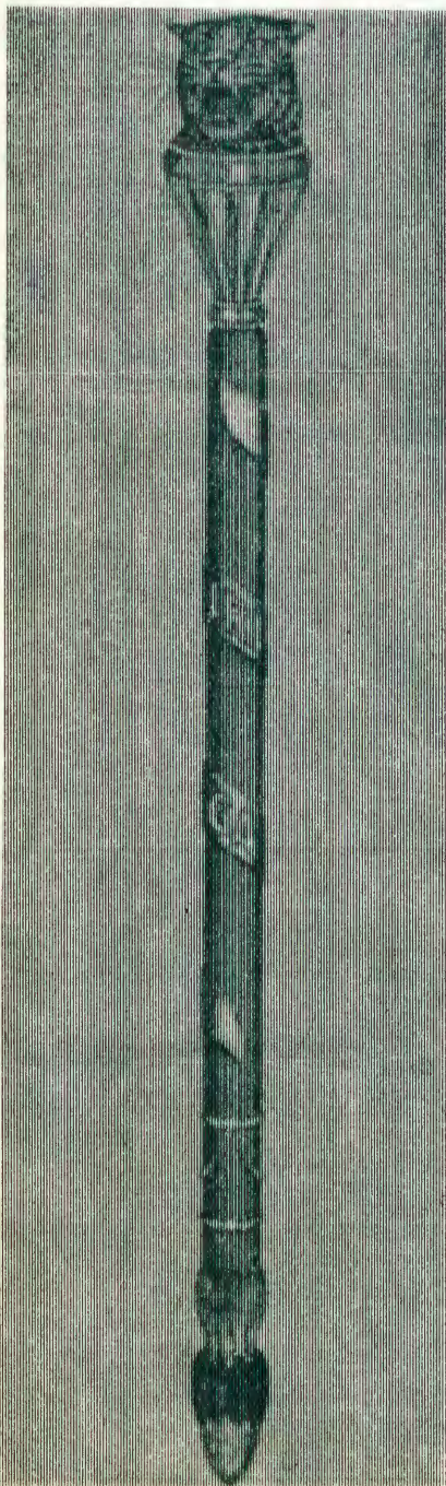
Odimbo yepangelo laLebowa ya yandjwa 14.8. 1969