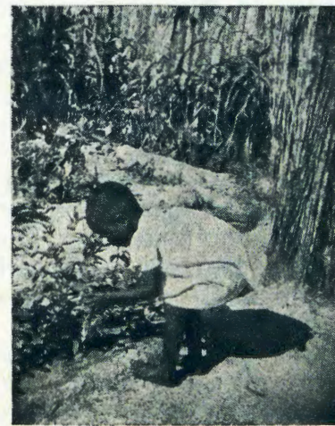
Omunona nguka a landitha oambo mOstola yomambo mOniipa.