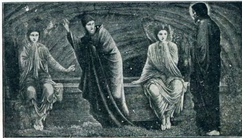
Kee mo muka, okwa yumuka. Dhimbulukweni ndhoka e dhi mu lombwele manga a li ku Galilea, sho kwa tile: Omuna gwOmntu e nokugandjwa miikaha yaalunde nokwaaelwa komushigakano nesiku etitatu e nokuyumuka.

Ihe nena elaka ndika olya igidhilwa oonakukonga Jesus mombila. Nongula ndjiyaka oya li oyetendo lyeluwa epe lya tendele aakuuyuni kuyi ya kuumtumba momilema nomomuzizimba gweso (Luk. 1:78,79; Jes. 9:1). Onke olyo elaka lyokutululula omwenyo molwa shoka okwa yumuka kuusi. Oonakumukonga noonakumulandula itaa tila we eso, ya mangelulwa moonkondo dhuulunde. Elaka ndika 'inamu tila' otali thikithile momwenyo dhetu tse ootaali, oshili ndjika kutya, itatu pumbwa okutila sha we, oshoka (1) okokuyumuka kuusi kwa Kristus otwa hanganithwa na Kalunga notatu mono ombili meyukupalitho okeitaalo, molwa shoka