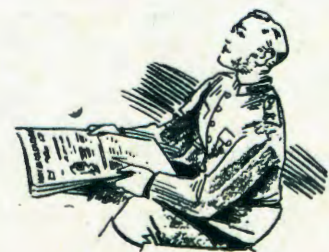
Aanandunge oyo mboka haa lesa.