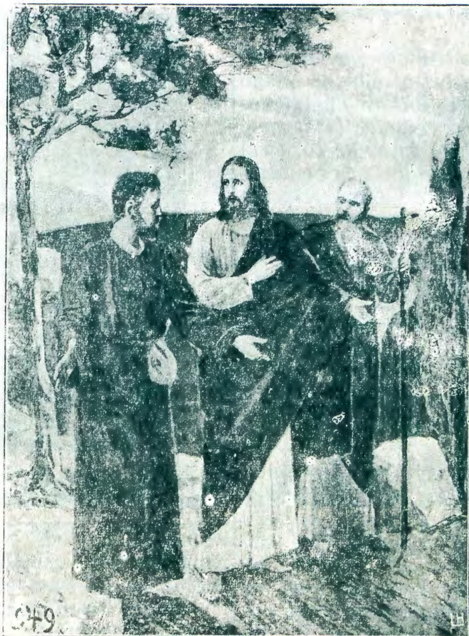
Jesus sho a yu- muka ngeyi kuu- si, mu ithana ano mu kundathane naye.

Okuthikama kwoye posheelo sha thinana okwo oshilonga shOmbepo Ondjapuki, ihe dhimbulukwa otaku pumbiwa okupita u ye meni lyoshelo. Oto tila, oshoka osheelo osha thinana, pamwe ito gwana po. Okupita mosheelo sha thinana ngeyi, otashi pula omuntu okwihula ashihe tashi tu thindi pahi, nuulunde ihau lwedha oku tu idhingila. Hebr.12:2. Okwihula okwo tuu nkoka: Nge tatu hempulula oondjo dhetu, nena oye omudhiginini nomuyuki, no te tu kuthile po oondjo no te tu yogo omayonagulo agehe. 1Joh.1:9. Okupita mosheelo sha thinana osha kala ku ngame oshidhigu, ihe Kalunga na hambelwenda piti nga. Onda mono oyendji ya lili mokupita mosheelo sha thinana. Okupita mosheelo sha thinana otashi ti: Okuhempulula omayonagulo gomeholamo na ngoka gi igalala. Okuhempulula oshiponga shuutsa, shuu-