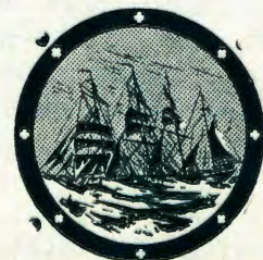
Eyumuko lya Jesus tali sindi iikungulu.