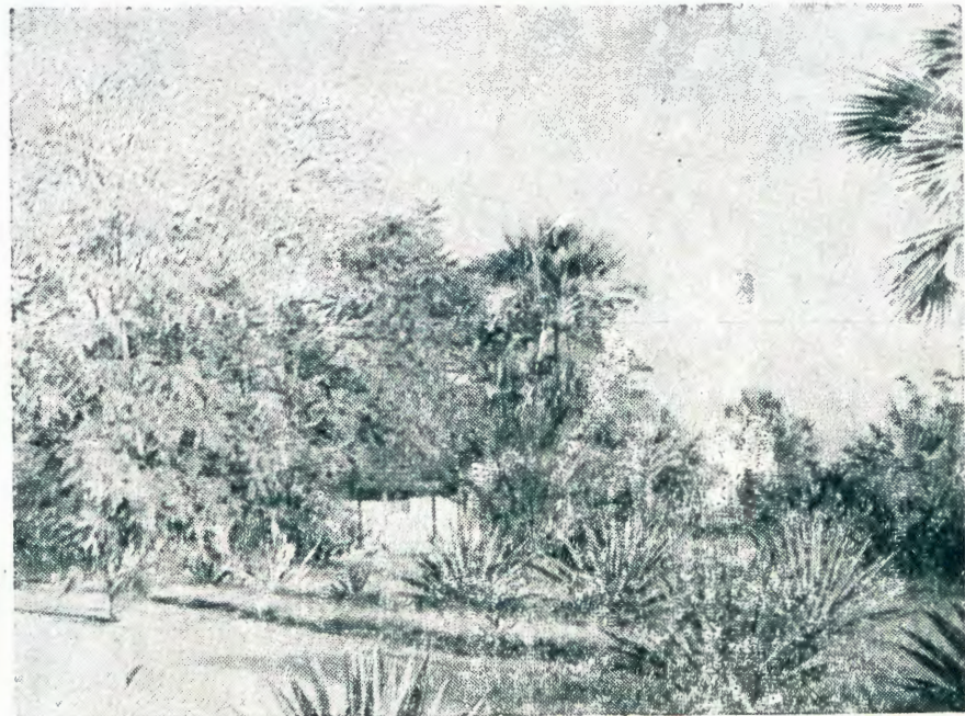
Uyuuni wa shitwa kuye, onke ayehe ye nokutsoongolo koshipala she noku mu longela.

Ndele tu longa yo okutambula eeshali doye noku ku pandula.