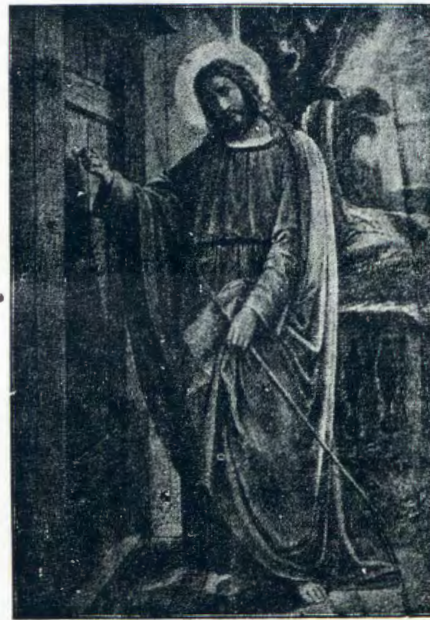
Jesus ta hala a ninge omupangeli gwegumbo lyoye.

Tashi ti oli li kumwe naalo la longifwa tete kongerki mokati ketu. Eongalo ola kundafana nawa nola tala tuu shili oungone ou wa holoka mehombolo kutya, otawu ka shundula ongerki, ndele tai kala molupe