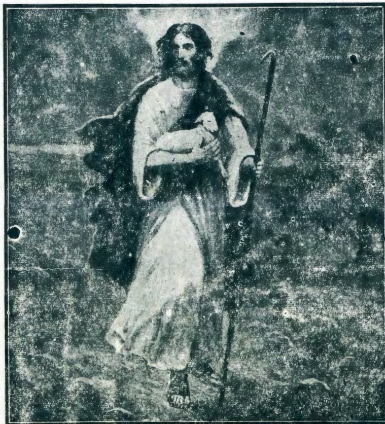
Oonzi adhihe otandi dhi gongele, e taku kala ohigunda shimwe nomusita gumwe.

Meedula heimwe da shikulafana, oimati yomaludi twa tumbula apa, ya hovele itai ima vali nawa. Luhapu omangongwa ayo haa yaumuka ko ashike ile tai pele ashike. Fiku limwe itai ima nande nande noto hange ashike penya na penya okaimati kamwe. Oipandomwa yo ya hovele okupumba nopaipe oya pumbalela. Oifitukuti oya pwa mo konyala meefuka edi, osheshi ve i yasha po alushe noitai tane vali. Epangeto la kelela yo, kuha dipawe oifitukuti, okuninga u nombapila. Ovawambo va tula meefuka edi nofuka ya dundulwa koimuna, ya kanifa hano olupe layo. Omambibo nomanghete oo a kala kehuli lomuyelege, ihaa mene nokwima vali nawa. Osho va kala ve linekela, Kalunga a fa e