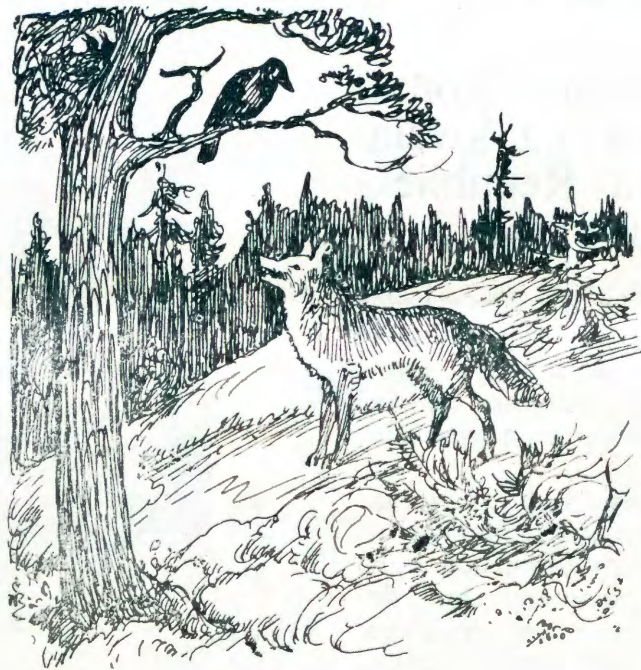
Lungama, omutondi ote ku kotokele.