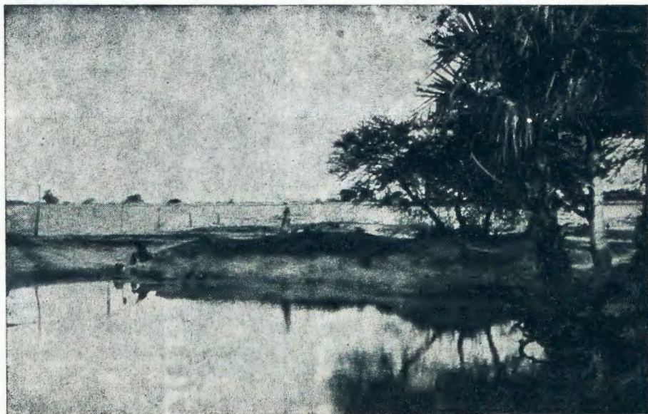
Nok uhugila omikoka dhalyo, noku yelulitha omutunda, o to dhi tut ikith' omvula, niimeno yalyo oho yi laleke nuuyamba.

Kalunga okwa yambeke oshilonga shaatumwa aaSoomi apehe, nando ya longo mokati komaudhigu o-gendji nonando yu uvite uunkundi wawo nomapuko gawo. Omutondi a li po e nokuya ontuku yOmusindani Omunene, Jesus Kristus. Egongalo lya Kristus lya koko.