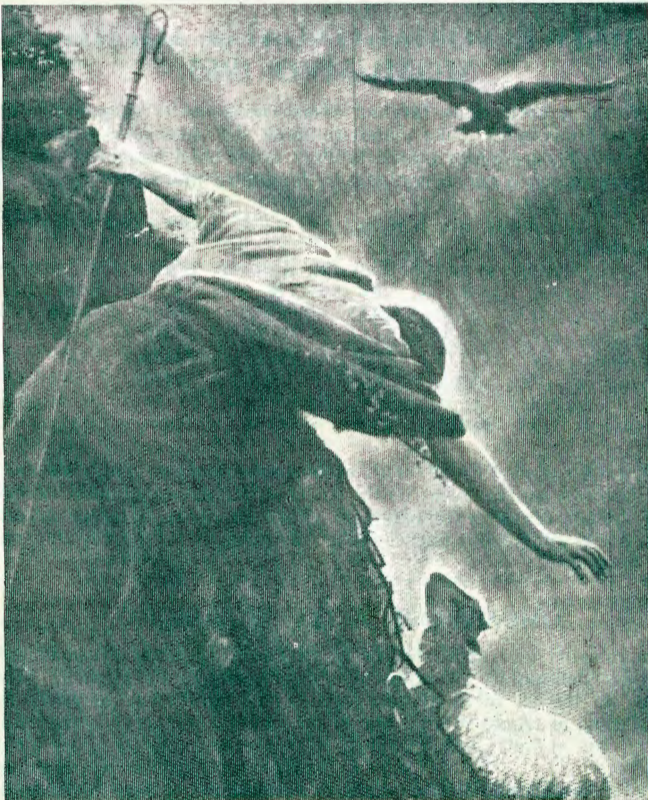
Jesus ta kongo onzi nokwe yi mono konima yemanya.