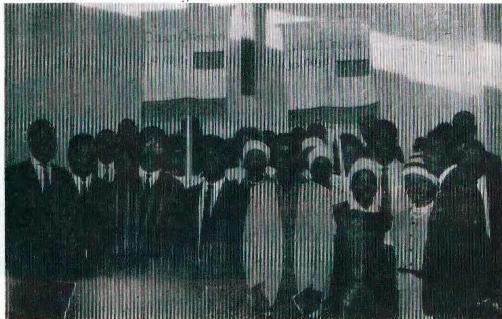
Ongundu yolwiimbo lwaaVenduka.