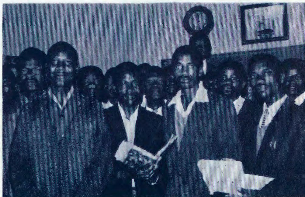
Ongudu ei tu wete mefano eli, oyovanyasha vomostata muWindhoek mohungi yavo.