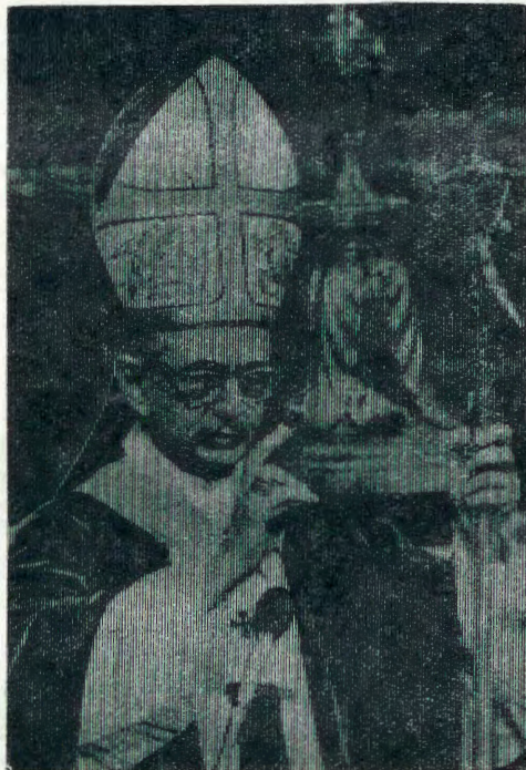
Omupapa Paulus VI okwa gwanitha omimvo 75 muSeptemba 72. Ota wilike aakatolika konyala oomiliyona 600 muuyuni auhe.

Pamauthompango omupehawiliki oku na oshimpwiyu oshinene meni lyongerki nopondje yayo. Ongerki ndjika ya ELK oya walwa kEtumo lyAandowishi noya hangana kumwe nongerki yetu, Elok, nuumvo.