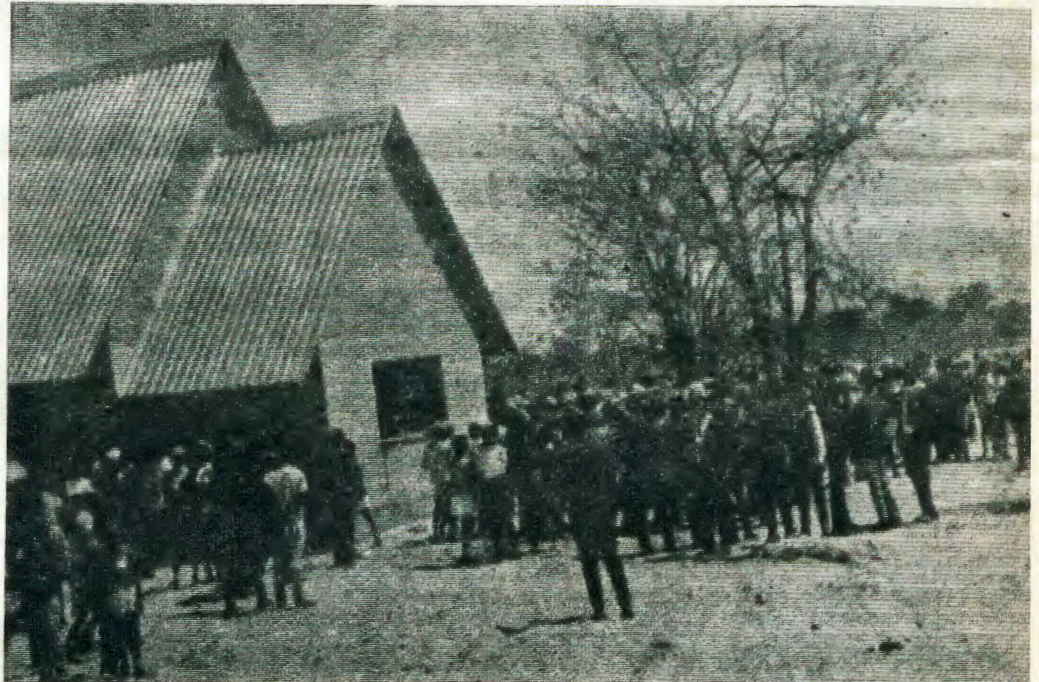
Etungo lyongerki ndjika kekatho lyimaliwa yaagundjuka, mongerki ayihe, otali pumbwa natango konyala R400 nenge shi vule opo yi kale ya pwa. Oshigongi shaagundjuka ayehe mOngerki osha thikama puyo nokukuminwa eenditho lyaKalunga sho e ya tokolitha omatokolo ga simana.