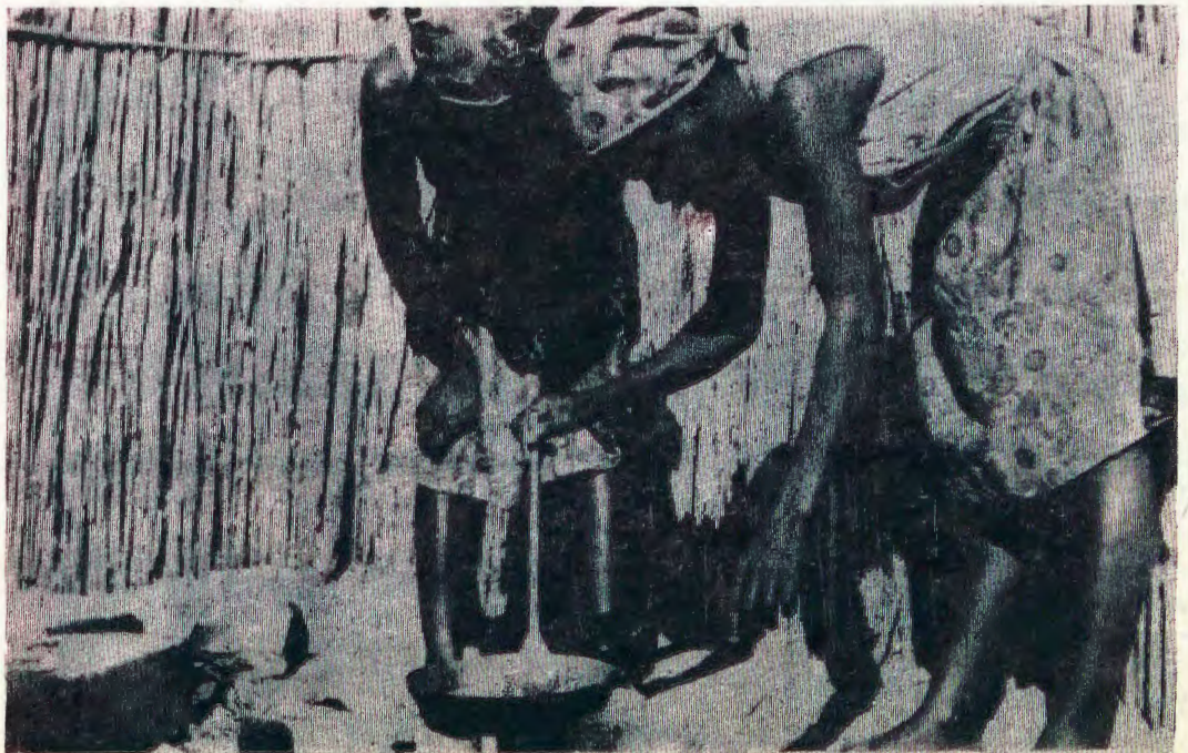
Aatekuligumbo otaa iidheula okuteleka

Ombimbela, nootseyo yegongalo, ontseyo yondjokana, okulela aana okuteleka, okwoopaleka egumbo, okuyoga nokukangula, ayihe mbika oya kala ehuku lyootundi dhawo. Konyala kehe gumwe ohi inigile wo oshimpungu shoshikunino nokwiidheula mokutekula iimeno.