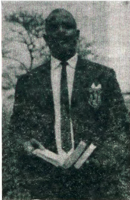
Omunelago omulumentu ngoka, ihaa kala pamadhilladhilo gaakanakalunga noiha kuutumba koshipundi shaasheki oye e hole ompango yOmwa, nohe yi dhiladhila uusiku nomutenya.