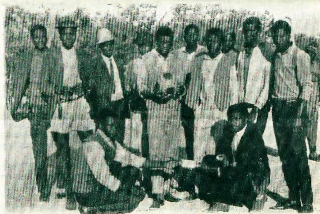
Aamati yomOshitayingerki shUuninginino oya li ya sindana metanga lyokudhenga koonyala montanda mOupundi Onguediva numvo. Aamati ye li omutumba oya kwata Ombimbeli ye yi pewa esindano. Ano aasindani mOngerki ayihe, noya yi netanga lyekondjelo.