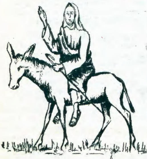
Jesus ta longitha okasino ka mangululwa

Eifupipiko ohali dhimbululwa mokukala kwomuntu, ando ngashi tu tye omuntu oku li po pamwe oku nedhina lya simana, e na oondunge uuyamba, ye e ti ifupipike. Nge ti itala ye mwene ita mono muye iini ma mbyoka twe yi tumbula. Ihe momeho ge nomomadhiladhilo ge mwene oti imono oye omuntu gwowala nohepele.