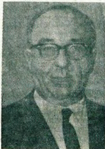
Nakufya Levi Eshkol