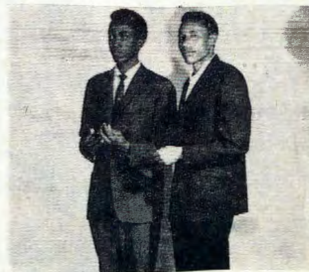
Ovawiliki vovanyasha mOvenduka