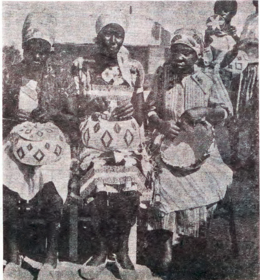
Aalongwa otaa longwa okutunga iitungwa yomaludhi.