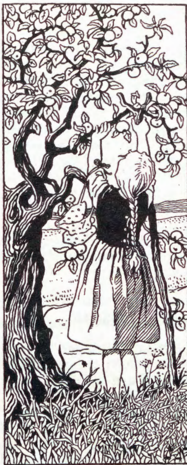
Omuti otagu tegelelwa gu imike iiyimati.

Eeno shili, esiku olyo tuu ndika lyonena, eti-1 Desemba 1967, uuna ne aakwetu aaholike, twa longo nane mwa yapulilwa moshilonga shuudiakoni, ngaashi nde shi kundana ngaashingeyi. Nando nda nyengwa okukala moshituthi sheni palutu, oko nda kala pambepo nondi itula mongundu ndjo onene yookuume keni ye mu halele eyambeko lyaKalunga Tate, lya gwanenena. Eyambeko lye tali landula mboka aafupipiki momwenyo, mboka taa kongo esimano lyaKalunga, handyo lyawo yene omokulonga kwawo. Eifupipiko katu li na mutse