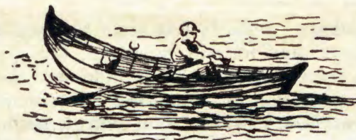
Muuyuni twa fa tu li mokawato kombanda yefuta.