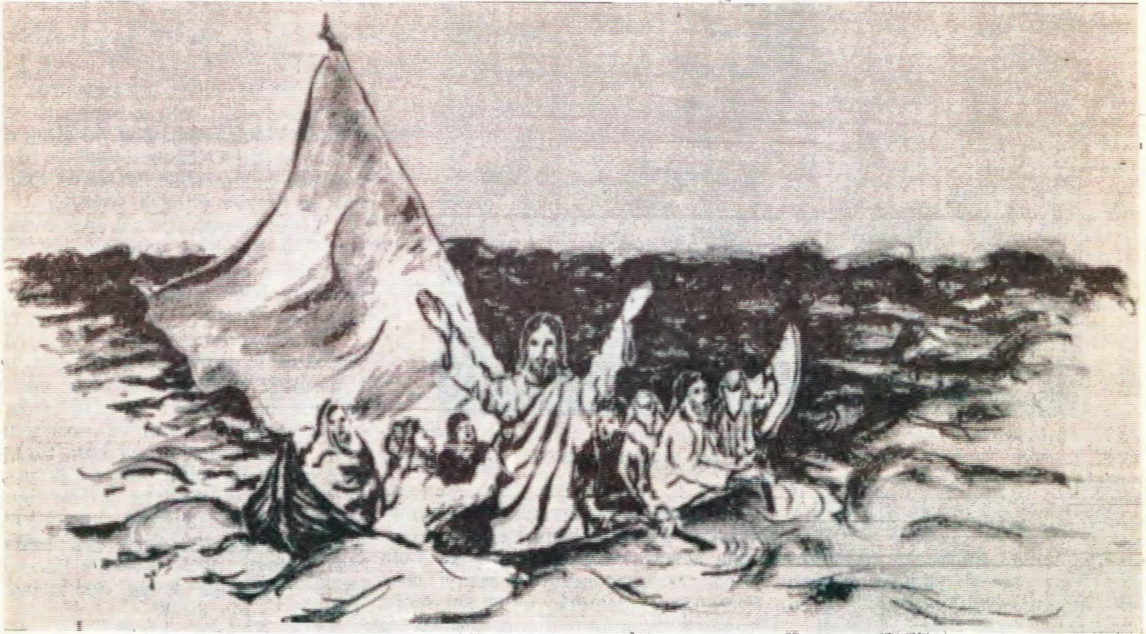
Nonena Jesus ta ganda iikungulu mutse nelombwelo: Efuta, lota! etaku ti thilu.

Luhapu haku tiwa "Etale laGalilea". Onguloshi oyo yonale efuta ola li la mwena la yalalala ongekove linene lomwiidi wa tetwa ufike pamwe. Oudila ova li tava sheketa nounona va kala tava danauka onguloshi nemanguluko, inaku diladilwa otaku uya oshikungulu.