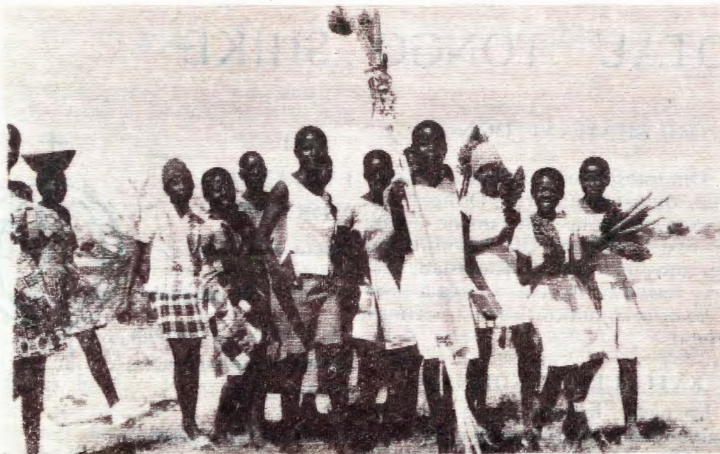
Aanona yegongalo lyOniipa taa ka umba ongalo yoshipe.