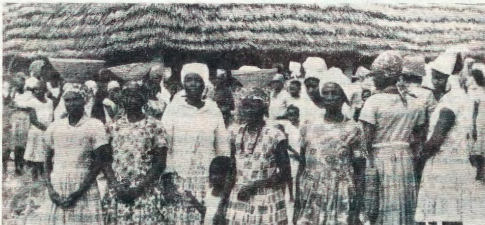
Ongerki yokuTshandi. Aantu ya piti pondje pethimbo lyokafudho moshingishi shaakiintu.

Mongundu yetu omu na aakadhona mboka ya hala okuuvitha Kristus nomaimbilo nomapopitho wo. Ongundu yetu tayi gongala kumwe moshiwike, ongulohi yomEtine, medheulo, pampumbwe tatu vulu okugongala lwalu nokuli.