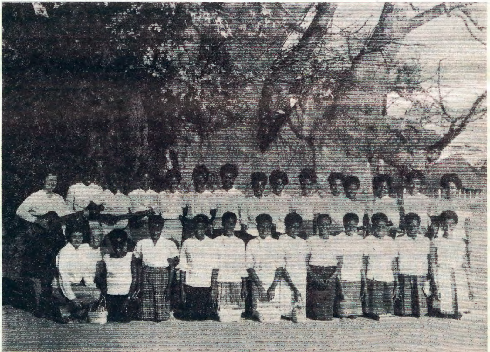
Ongundu yaahiki yokOnandjokwe ya thanekelwa kuTshandi pekota lyomukwa omunene. Etata lyongundu alike lya wapa okuya koshigongi omolwiilonga ya manga yalwe.