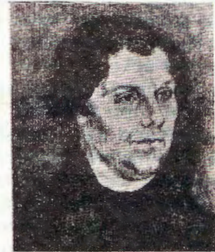
Omuyelifi weitavelo Dr. Martin Luther.