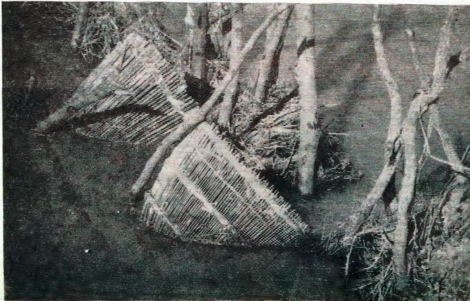
Mefano oto mono ouluwa, wa tawakana oshana shomeva efundja. Momeva omuyadi eeshi neenhangu, odo da halika omolwombelela. Poumhito opa telwa omidiva. Efundja nge le uya, oshilongo kashi na unene vali omukaa nde hatu ti oku noshishipo.