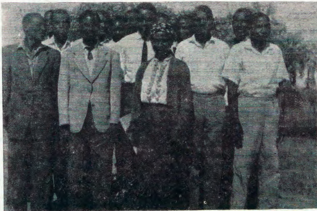
Mefano oto mono ongudu yovadiakoni, oyo ili mEngela paife. Ovo tava tekulilwa eyakulo lokuyakula ovakwanaluhepo mongerki yetu. Komesho kwa fikama omulongi wavo meme Aili Mwatootele. Okwa longa paife eedula nhano mEnongelo.