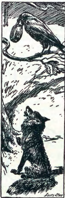
Ovawambo ova shiiva ehokololo lefan o eli. Otali holola oipupulu nomakengelelafano. Ombimbeli tai tu hanyene moihelele yomaludi keshe.

Ohashi kala ngo shidjuu kovanaudu va TB, okutwikila ouhaku wavo ngenge va lekelwa monashalesha, ndele mboli osho nee sha pumbiwa noshi na oshilonga mouhaku ou. ONAWA OVANAUDU (UNENE TB), MU LESHE NOUDIININI OITYA EI. Ngenge to uya moshipangelo u na TB oyo ya ninga oipute neembululu, oho tambulwa monashalesha. Eshi ohashi monika nawa keminikilo. Oshimha tuu wa hakulwa, oipute ei