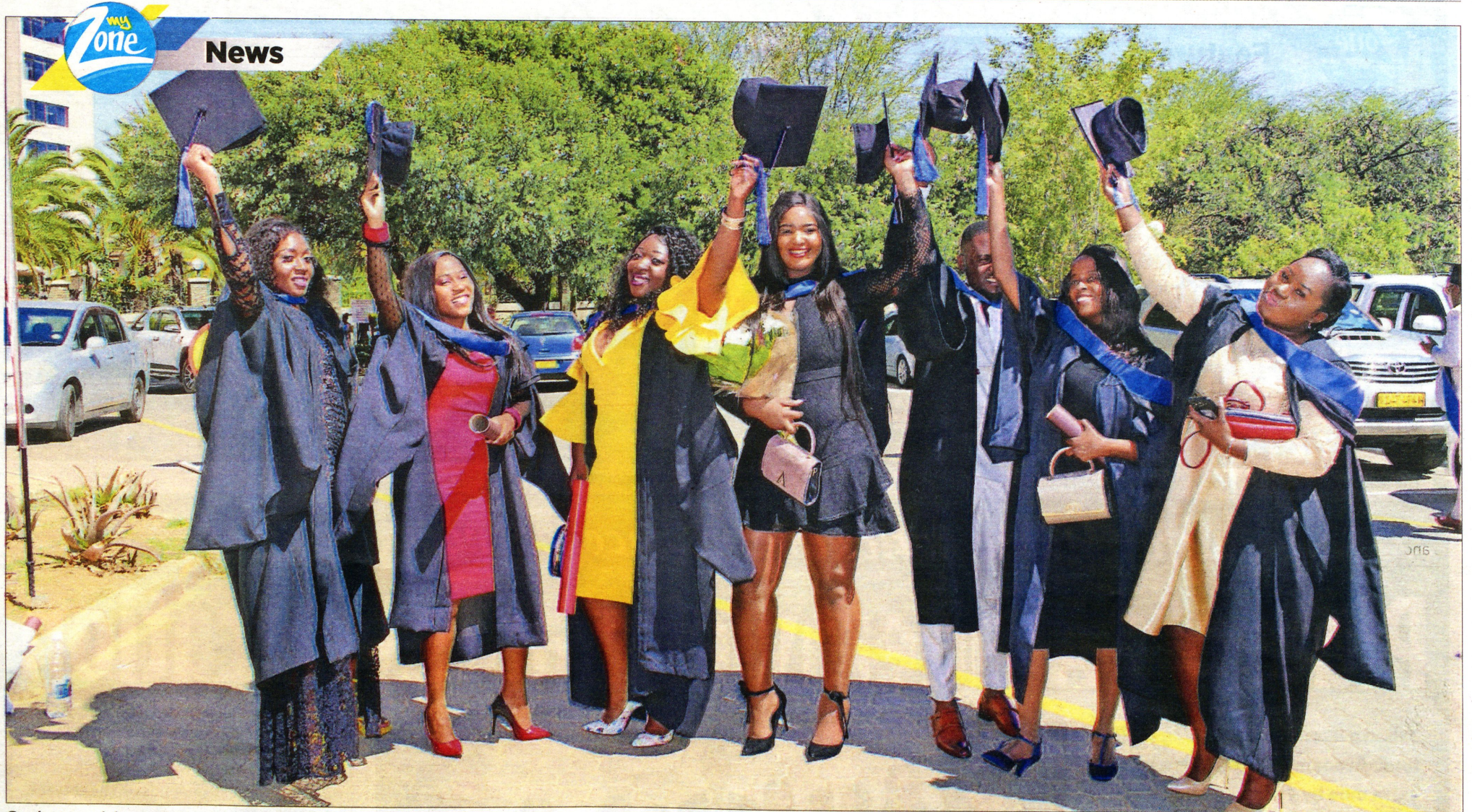
Graduates celebrate their milestone.