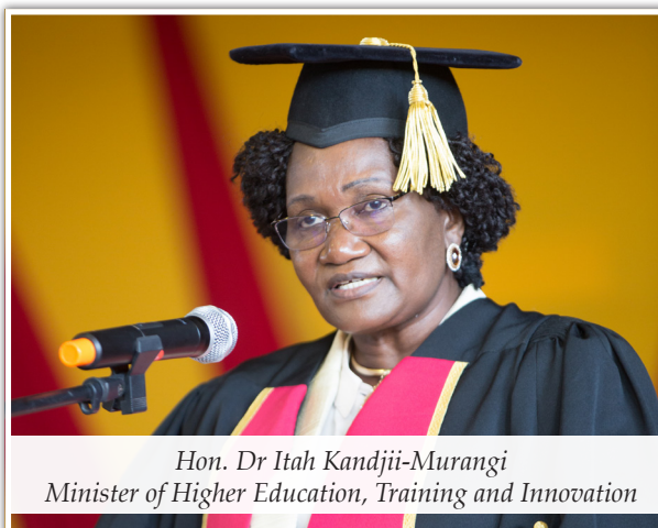
Hon. Dr Itah Kandjii-Murangi Minister of Higher Education, Training and Innovation